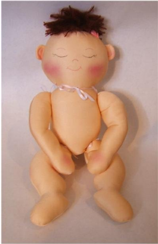
An Asleep face all made of little curved lines.