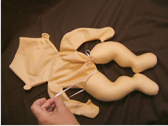
Stuff the feet and legs and tie the hips.