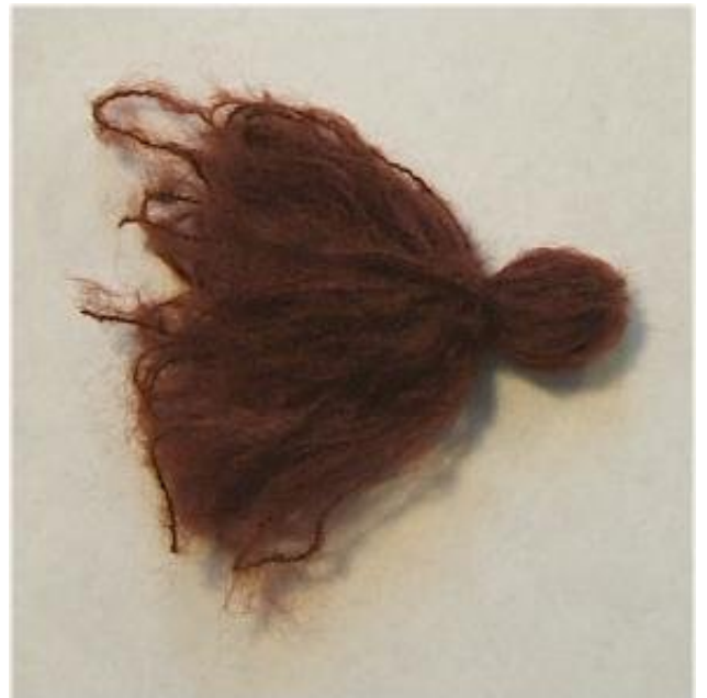
Tie the ball into the center of the yarn.