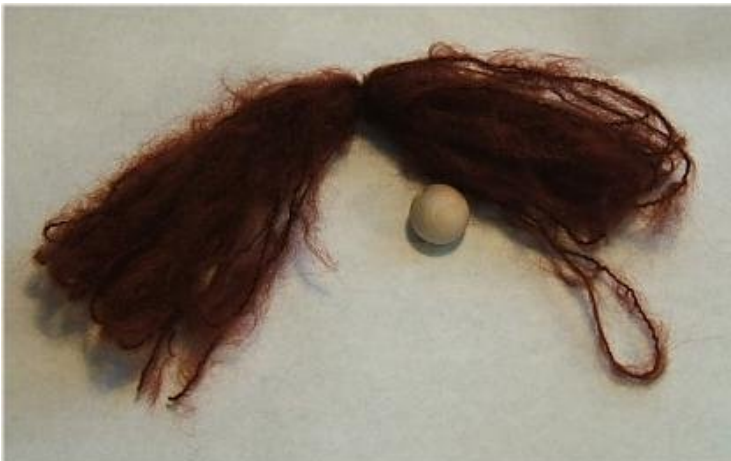
Prepare the yarn...I have used the wooden ball.