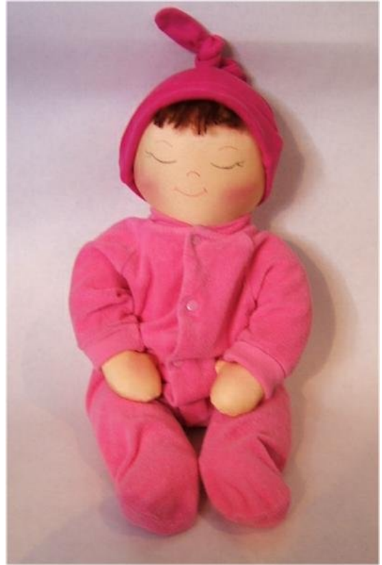
All ready for bed. The cap covers the awake face.