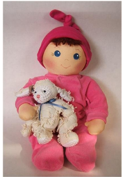
All ready for play. The asleep face is covered by the cap. I added little white dots in the eyes too.