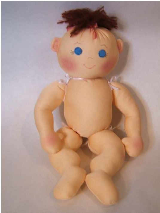
The awake face made of little curved lines and felt.