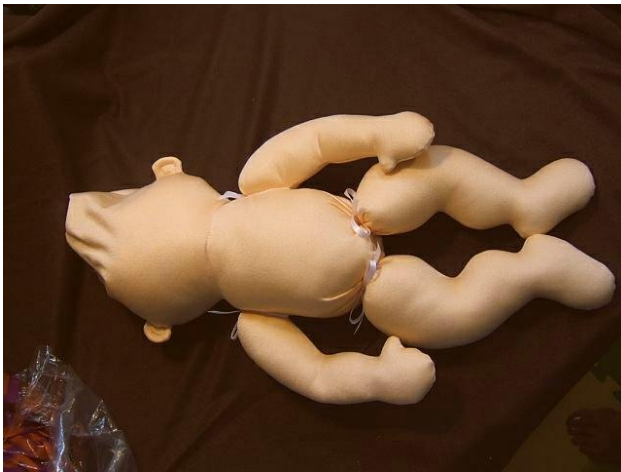
Stuff the tummy full and then fill the head pretty well.