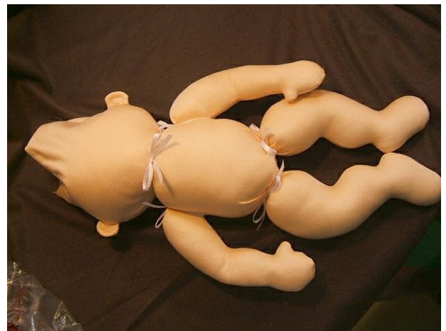
Tie the neck.