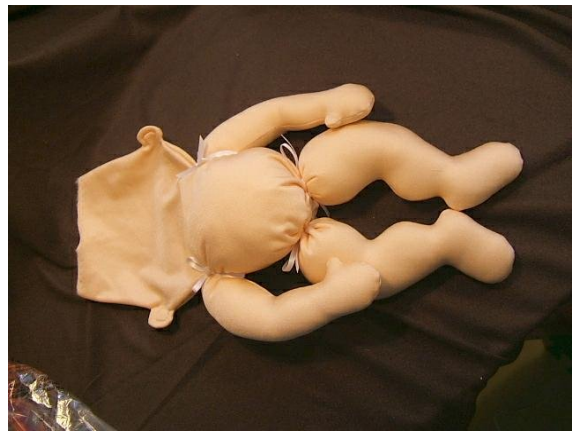
Stuff hands and arms and tie the shoulders. Stuff into the tummy now too.